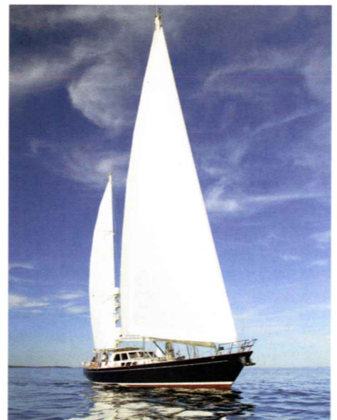
Above: Lion's Whelp Top left: Rabbit Top right: Freedom Middle right: Avalon Right: Too Elusive passing the R.C. boat, Ragtime. Bottom right: Gitana